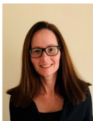
Curriculum, Learning, Teaching & Assessment

This session has been a busy one for our brand new Wellbeing for Learning workstream. We have worked with a variety of practitioners through all of our programmes including PSE Sessions, Family Learning and Trauma Informed sessions. It has been fantastic to be involved in this new workstream and drive forward the work. We are already planning for next session and due to the popularity of our PSE sessions we are giving practitioners the opportunity to sign up for early access- click here . I am looking forward to session 22/23 and offering new opportunities across our local authorities.