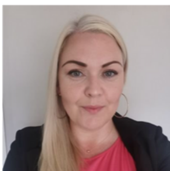
Wellbeing for Learning

As the end of the school year speeds ever closer all of this session's Leadership, Empowerment and Improvement workstream is busy gearing up for the new session. Improving Our Schools 2022-23 is already underway and the Masters level IOC has just finished recruiting. This session's IOC participants are sharing their learning and how they have raised attainment in their classes and it's a real privilege to listen to the presentations. They are describing a huge variety of practice changes through the use of different approaches, like feedback, metacognition and dialogic teaching - all with data driven evidence of impact on the children they work with. Our Thinking About Headship programme is still open for applications. If you're interested you can find out more on the website .