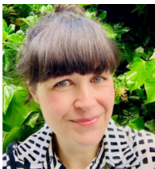
Leadership, Empowerment & Improvement